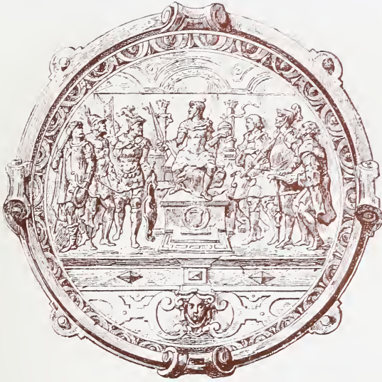
MEDALLION—THE TRIUMPH OF CHARLES V. Vatican.